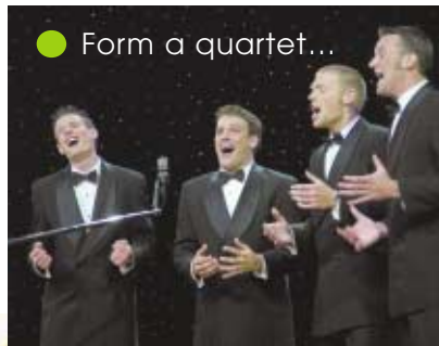
● Form a quartet...

We'll be glad to provide coaching and guidance in song selection. Visit us at www.barbershop.org/college to hear some exciting sound clips. Then email college@barbershop.org or call 1-800-876-SING (7464) for more info.