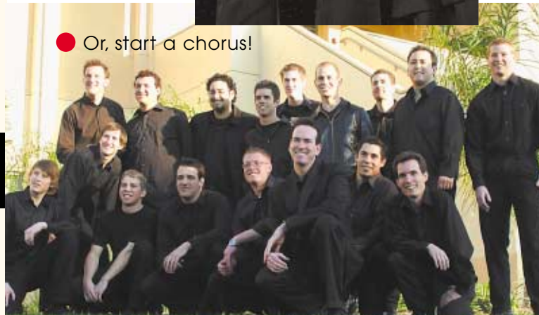
● Or, start a chorus!

© 2005 BARBERSHOP HARMONY SOCIETY WWW.BARBERSHOP.ORG